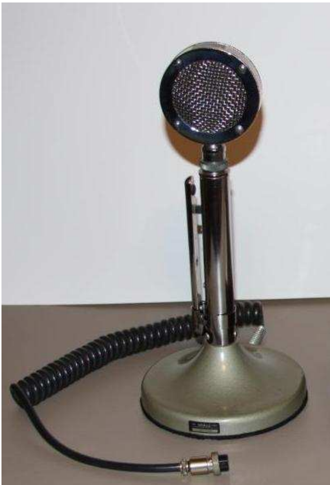
Astatic Model D-104 Microphone

Unbelievable condition. Build in amplifier in the base powered by a standard 9V battery (not included).