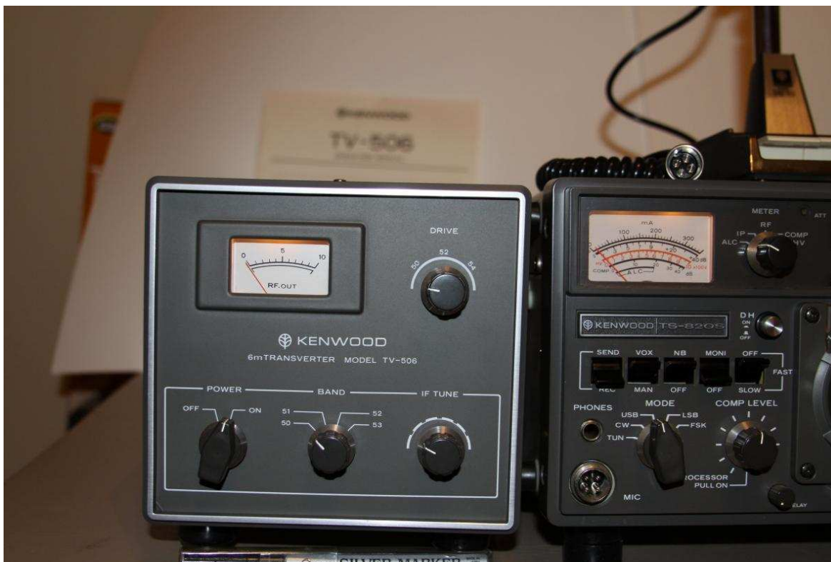
Kenwood TV-506 6m Transverter. I actually removed this unit from the box as it had never been unpacked from the dealer. Interconnecting cables are included. SOLD