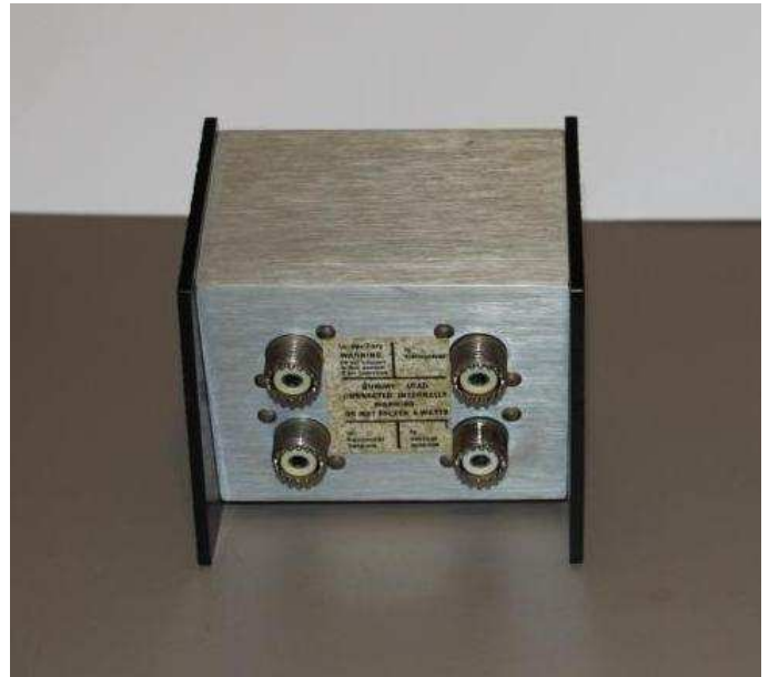
Back view Asking $25.00