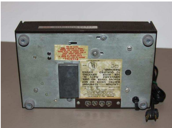
Bottom view 4-wire rotor system (No Brake. No potentiometer position feedback)