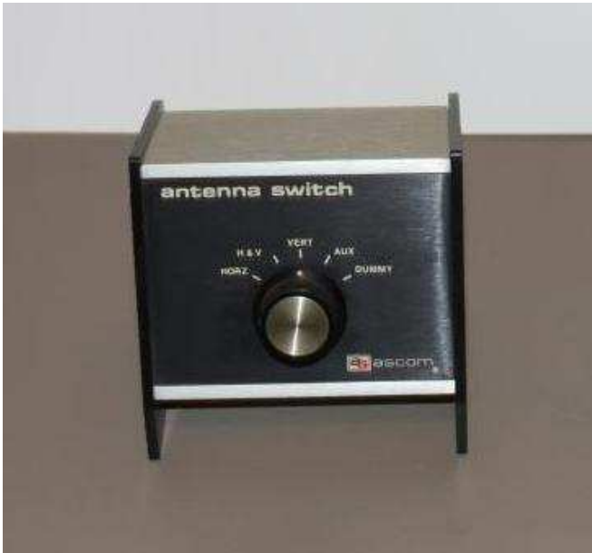
Ascom 3-Antenna, 5-Position Selector Switch including Dummy Load