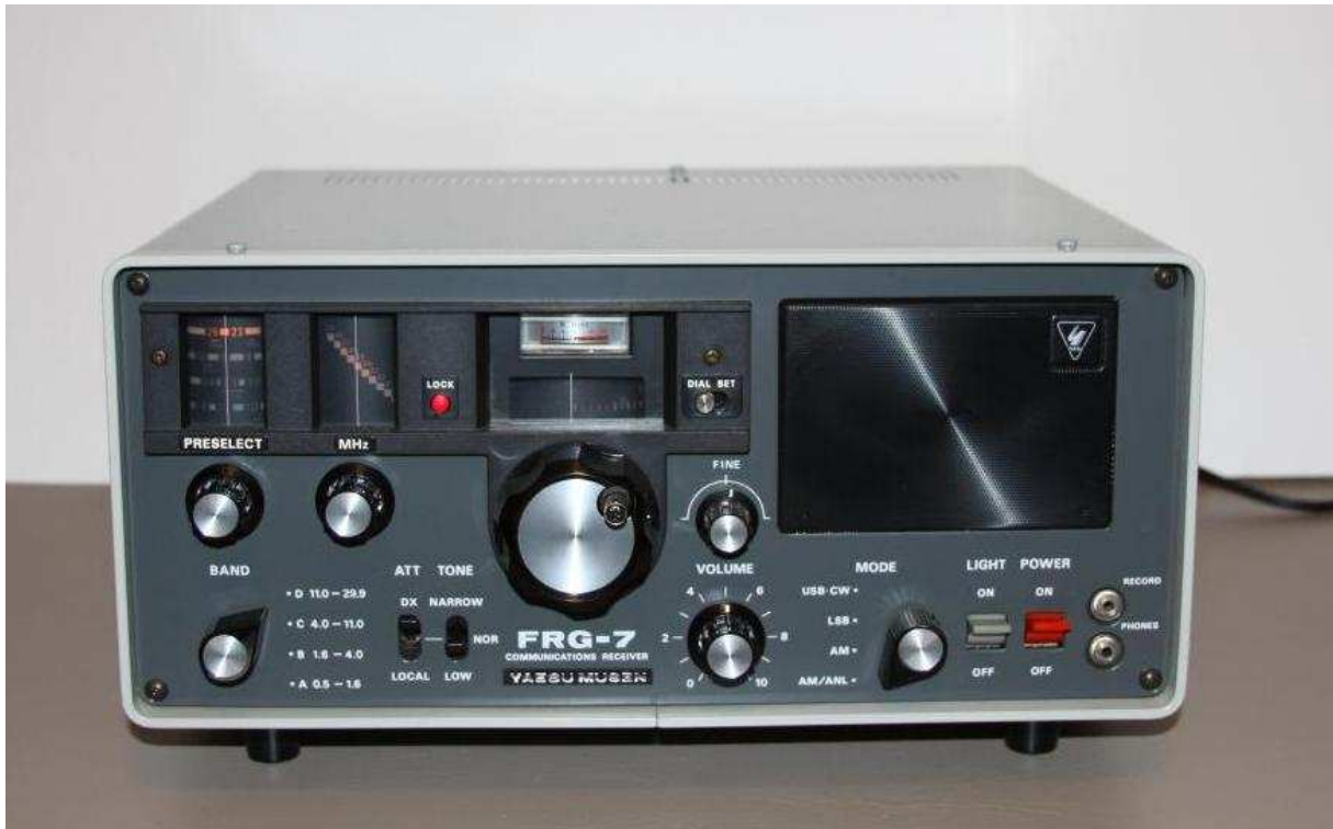
Front view of Yaesu FRG-7 Communications Receiver

Yaesu Communications Receiver Model FRG-7. Unit is MINT condition.