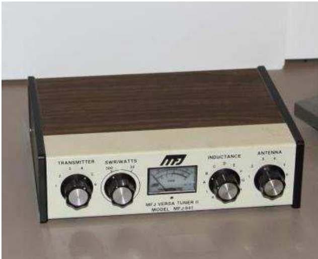
MFJ-941 Versa Tuner II