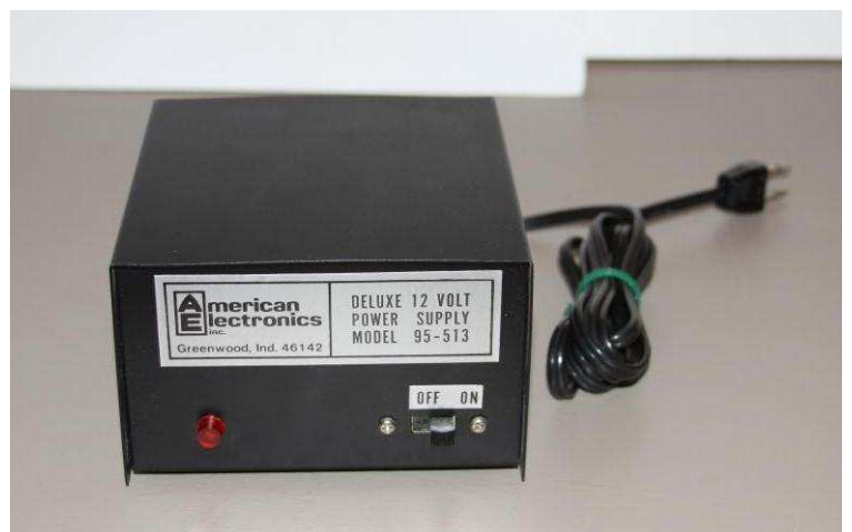
American Electronics Model 95-513, 12V Power Supply, 40watts 2 Amp Continuous, 3 Amp Surge. Asking $20.00