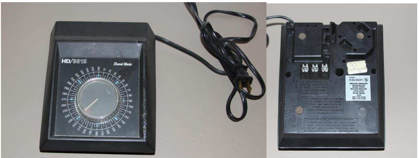
Channel Master Antenna Rotor Controller (only – no rotor) Model HD/9515. 3-wire, 115 VAC In / 30VAC Out