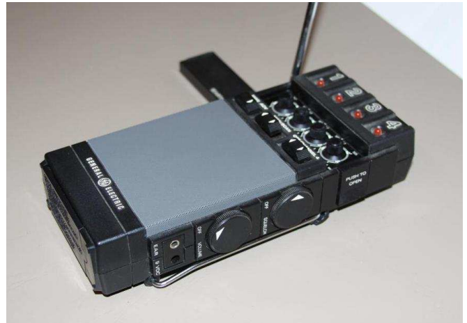
General Electric 4-Channel Scanner, 150-174 Mhz, Individually tuned.