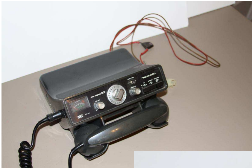
Realistic CB-Fone Transceiver, 23 Channels

Free if you buy the Cobra on the previous page. Otherwise $10.00