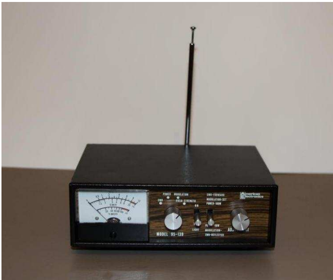
American Electronics Model 95-139 SWR / Power Modulation/ Field Strength