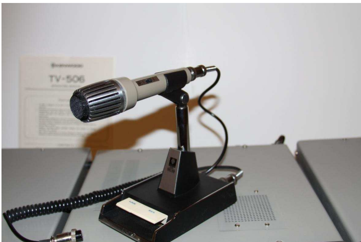
Kenwood MC-50 Cordioid Dynamic Microphone SOLD