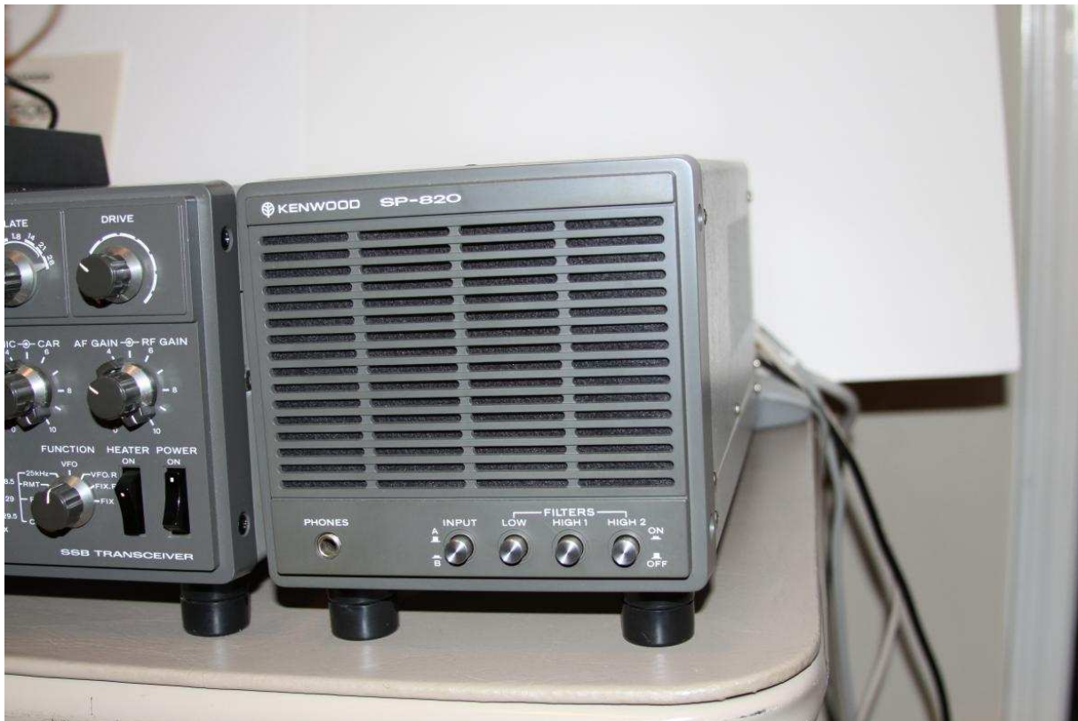
Kenwood SP-820 External Speaker unit SOLD