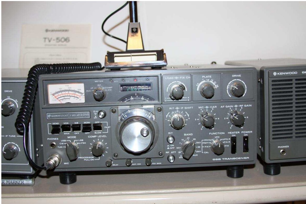
Kenwood TS-820S in MINT Condition – SOLD