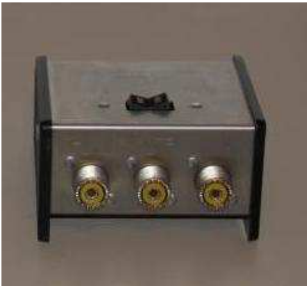
Avanti 2-Position Antenna Switch