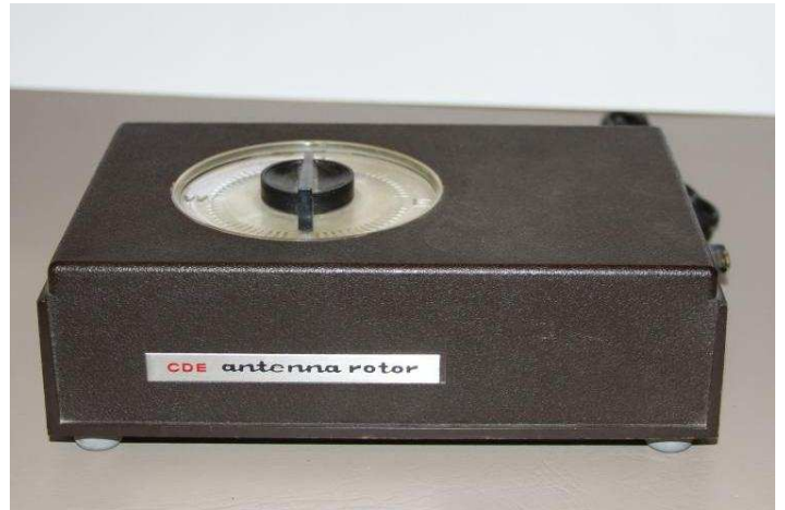
CDE Rotator and Controller