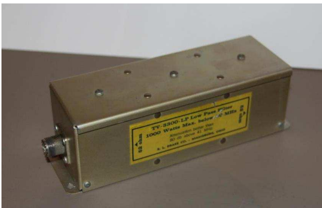
R.L. Drake TV-3300-LP Low Pass Filter 1000W Max below 30 Mhz