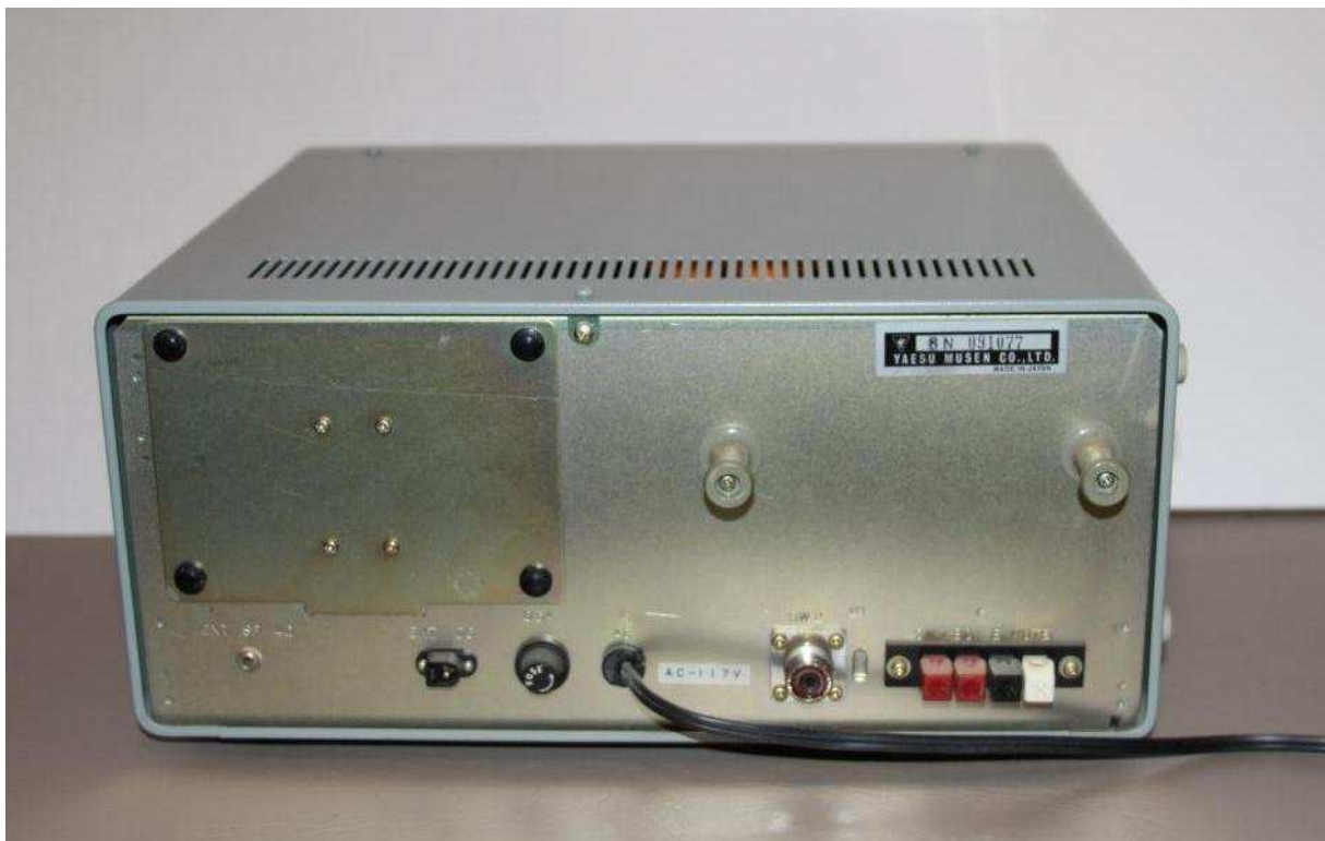
Rear view of Yaesu FRG-7 Communications Receiver