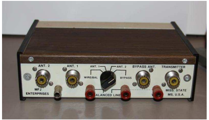
Back view of MFJ-941 Versa Tuner II